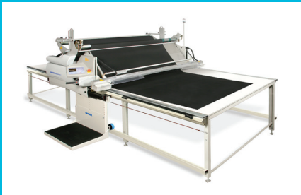
Available for left- or right-hand operation

The XLS125 is designed for maximum performance, repeatability and productivity.