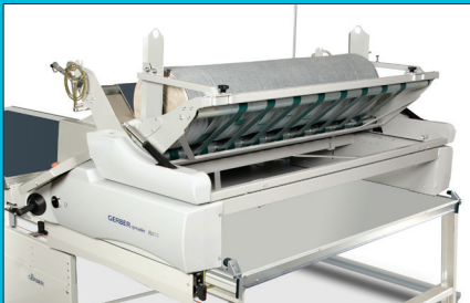
Cradle feed system provides tension-free spreading