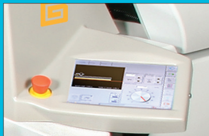
Intuitive graphical touch-screen simplifies operator training and use